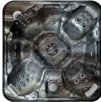
MIDNIGHT CANYON+ Luster Swirl**