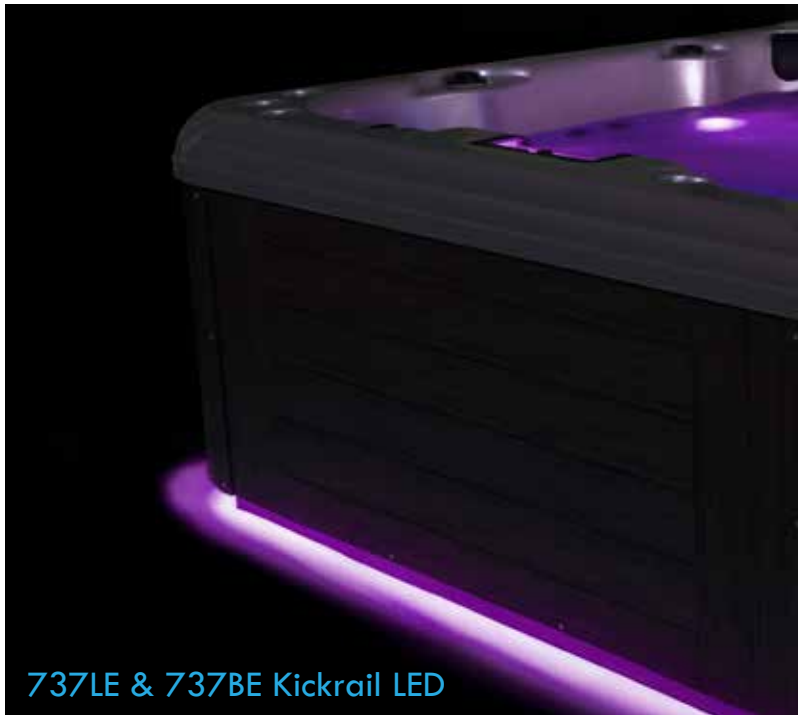
737LE & 737BE Kickrail LED