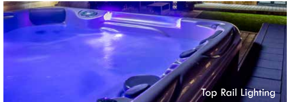
Top Rail Lighting