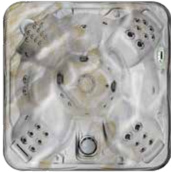
SMOKY MOUNTAINS+ Luster Swirl**