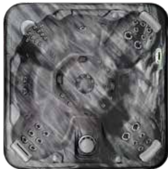
STORM CLOUDS Luster Swirl**