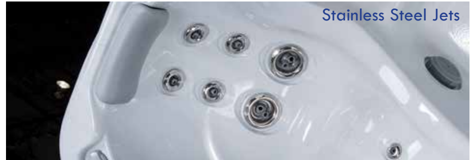
Stainless Steel Jets