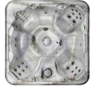
GLACIER MOUNTAIN+ Metallix**