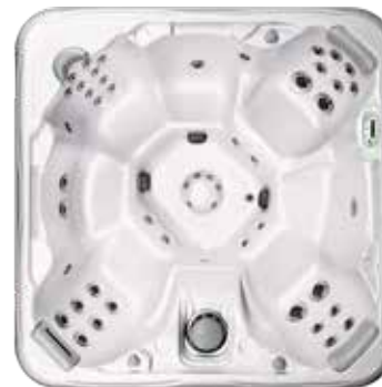
WHITE PEARL+ Luster Swirl**