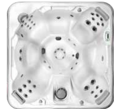
SILVER MARBLE+ Marble

**Upgrade Colors | +965L Deluxe Available Color