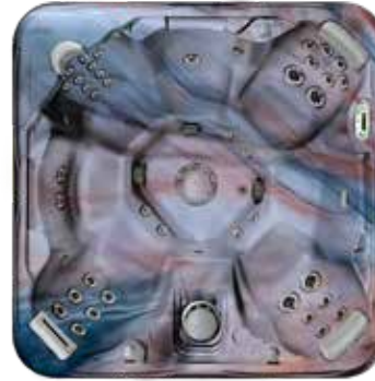
TUSCAN SUN+ Luster Swirl**