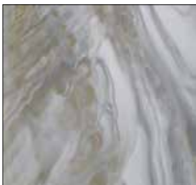
LUSTER SWIRL*, Smoky Mountains**