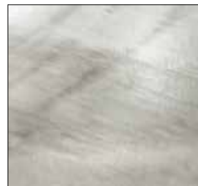
METALLIX*, Glacier Mountain**