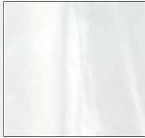
MARBLE, Silver Marble**