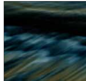
LUSTER SWIRL*, Midnight Canyon**