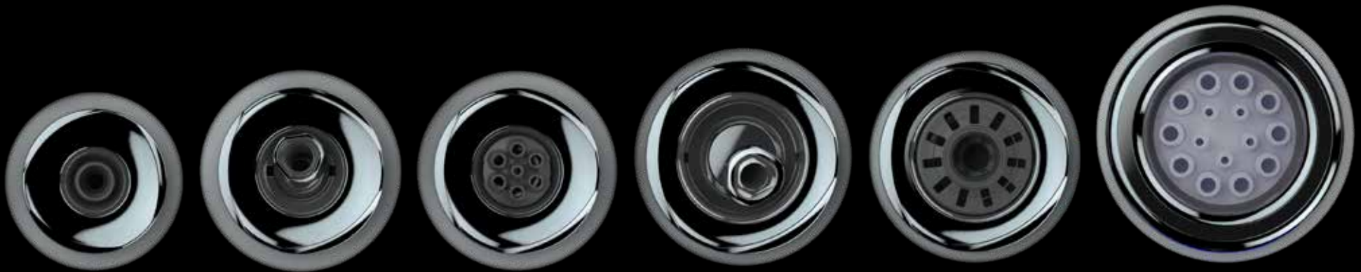
2" H 2 O PowerFlow Direct