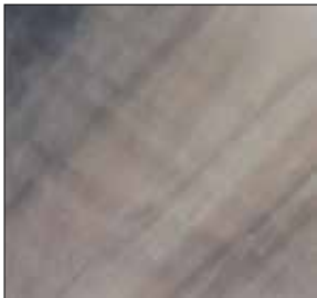
LUSTER SWIRL*, Tuscan Sun**